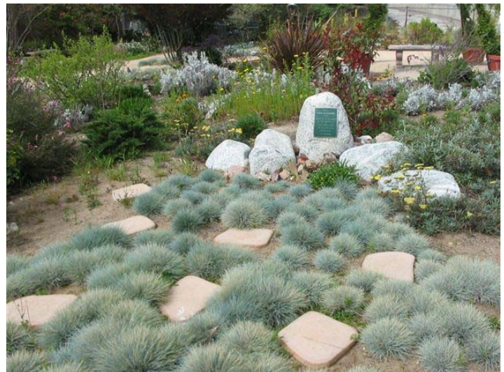
Dedication plaque to the community spirit and volunteers.