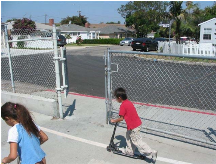
View of Purdue Ave. gate, homes beyond and two bikepath users.