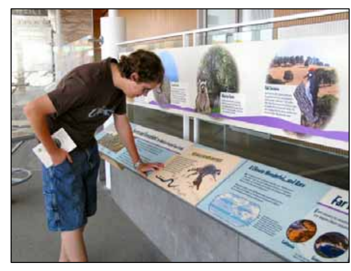
Visitor Center Exhibits

Opening Day. After almost a decade of planning and construction, the Baldwin Hills Scenic Overlook State Park opened to a public celebration on April 18. The park itself celebrates and educates us about the history and