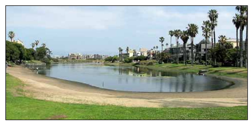
Del Rey Lagoon at mid-tide. Various shore birds forage here. At the back (north) end is the south bank of Ballona Creek, with a tidal gate between the creek and lagoon. In the distance are residences in Marina del Rey.

Shore birds visit the Del Rey Lagoon, which connects to Ballona Creek and has full tidal flow. In February, local environmentalists and Playa del Rey residents scrambled to rally against proposed construction on a portion of the lagoon. The northern part is privately owned, while the rest of the lagoon and the adjacent park are LA City property. A community meeting presented speakers from various agencies and organizations. We understand the developer and LA City are talking about a possible purchase or land swap, strongly supported by Councilman Rosendahl, the Mayor, and local Neighborhood Councils. We'll keep you posted.