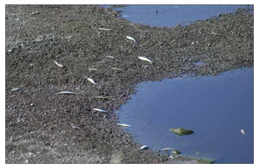
Some of the dead topsmelt at low tide in the May 2010 incident.

from the Marina Freeway overcrossing. It being low tide, the dead fish lying on the mud were obvious. Various birds were standing or flying around. Some were picking up the fish, others were wary. A shopping cart and plastic trash were nearby (not uncommon).