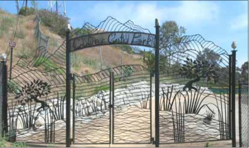
Gate to Culver City Park ballfields from Scenic Overlook road

See the "Rain Gardens" article on page 10. The Restoration and Stewardship project at the Mar Vista Family Center at Slauson Avenue is on-going, as is the MRCA's project with the LA Conservation Corps' planting native landscaping from Inglewood Blvd. to Sawtelle Blvd.