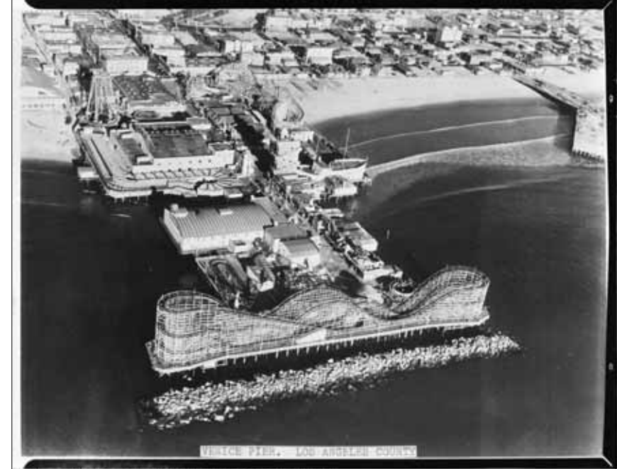
Aerial view of Venice Pier, 1937

These gardens will capture, treat, and infiltrate a 1 inch of rain over 24 hours from 11 acres of land on each side of the creek. The industrial/commercial side will be 1000 ft long by average 20 ft wide and the residential side about 350 ft long by 25 ft average width. Maintenance will involve keeping the area free of non-native vegetation and changing the storm drain