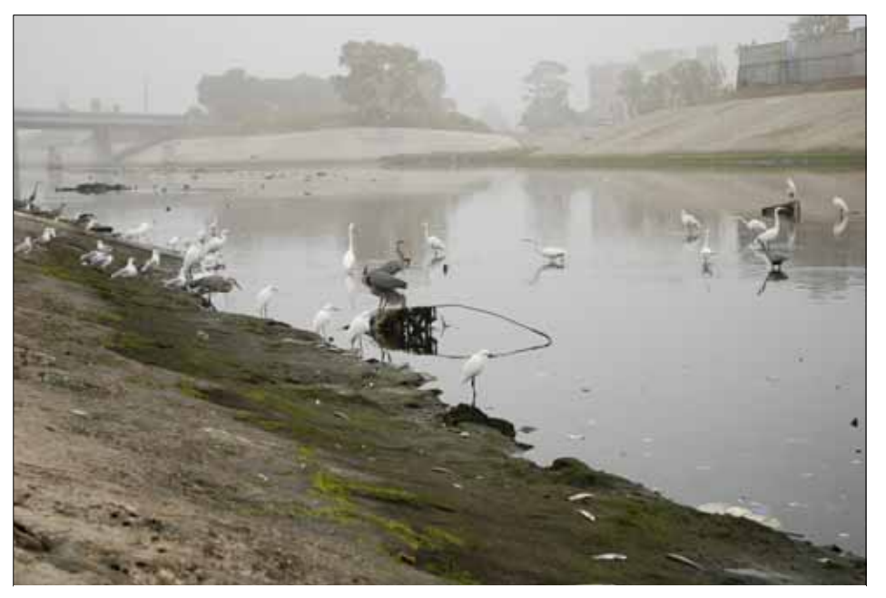
Egrets, herons and other birds standing around another topsmelt die-off in March, 2009. The birds seem to realize something is wrong, and most of them are not eating the dead fish, a few of which are visible at the lower right. At the left edge of the frame is the edge of the "Infamous" drain that is suspected of pollution; in the upper left corner Is the Marina Freeway, and at the upper center is the confluence with Centinela Creek. In the center is the inevitable shopping cart.

In addition to the monitoring performed by the City, the Santa Monica Bay Restoration Commission also conducts water quality sampling in Ballona Creek at several locations below the 90 freeway overpass. They collect data on fecal indicator bacteria, nutrients, metals, and additional water quality parameters. For more informa-