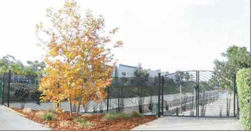
Duquesne Avenue Gateway

Duquesne Ave. Gateway (continued) "Rivers of the World" mural, which we hope will be renovated next year, lies just inside the gate.