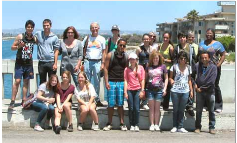
The Sister Cities youth and leaders during their Ballona tour.