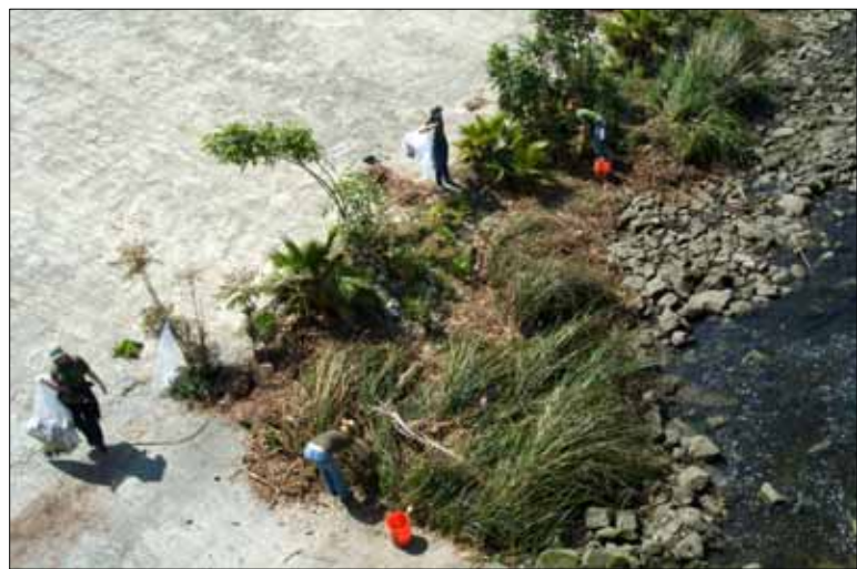
A section of the creek bank at Centinela Ave. before and after the Sony Volunteers cleaned it up.