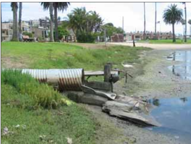
This pipe carries polluted stormwater runoff into the lagoon from the adjacent street.

Proposals to improve water quality include: