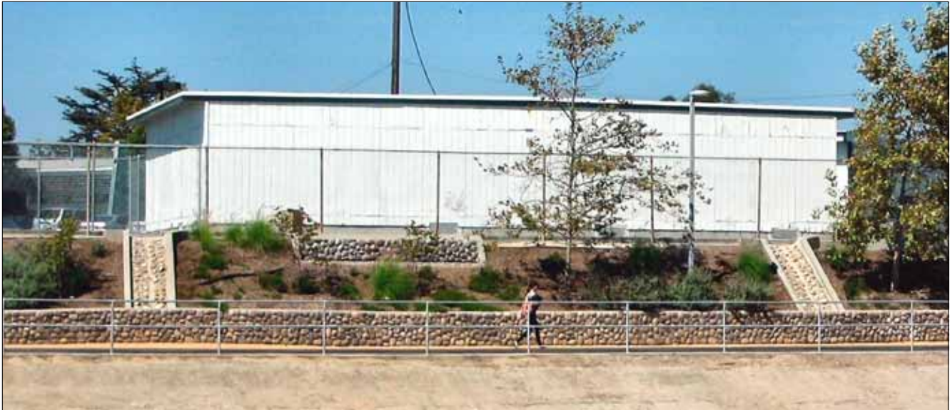
View from across the creek of a portion of the rain garden next to the bikepath, showing two of the drains for water from the Farragut School parking and playground areas into the landscaped gardens (more are to the right of the photo).

Our Fall 2011 and Spring 2012 issues described two “rain garden” projects in and near the creek channel. Rain gardens capture some polluted rain runoff from streets and parking lots and filter it into specially prepared ground basins instead of dumping it into the storm drains, creeks and rivers, and ultimately the ocean. The cleaned water can then sink into the water table for re-use. Native plants make them look like ordinary gardens.