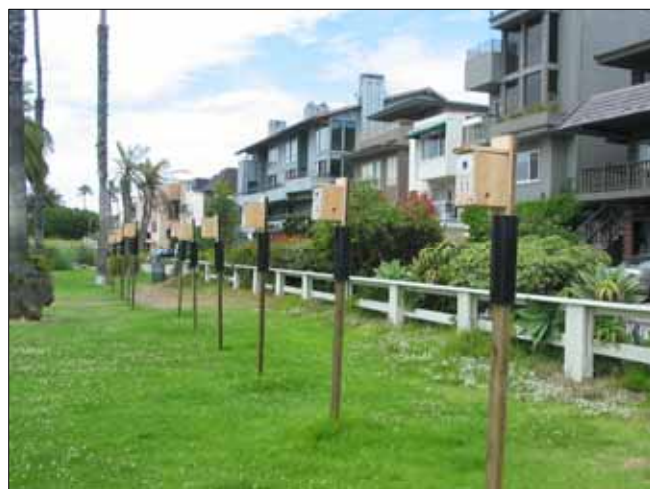
15 nest boxes lined up by Del Rey Lagoon

The scientific purpose of the nest box program is to develop and answer questions about bird behavior, such as what effect climate change may have on reproductive success or sex differences in loyalty to a particular site. A research team of LMU students, headed by faculty member Heather Watts, ornithologist, will investigate reproductive strategies of the tree swallow. Monitoring will involve daily checks during breeding season, including looking for eggs, recording the number of trips birds make to the box to feed, the date of the first appearance of fledglings and when they start to fly. Some monitoring tasks will be handled by the LMU science team, others by students and teachers.