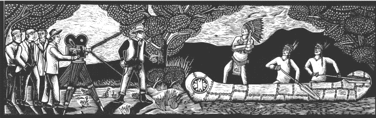
Top to bottom: 1. 1932 Olympic Village. 2. 1963 Baldwin Hills Dam Break. 3. California Rancho Period. 4. Early Western Films in Culver City.