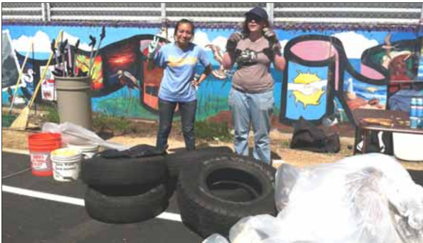
Two of the Hamilton High students who hauled five tires and rebar from the creek on Coastal Cleanup Day.

Coastal Cleanup Day, September 15. BCR managed two creek cleanup sites this day, one at our favorite spot at Centinela Avenue, the other at Overland Avenue beside the library and the renovated bikeway entrance garden. Over 150 volunteers participated. Some unusual items collected included 5 automobile tires, some rebar, various kinds of balls, a phone and a dead pelican. At Centinela, volunteers were amazed that a (live) pelican helped them clean up by pushing a ball out of the bushes towards them, seemingly unafraid of people and apparently understanding the significance of their work.