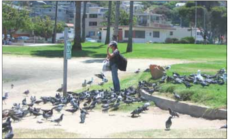
Hundreds of pigeons are attracted to the park only because well-intentioned but uninformed visitors feed them.