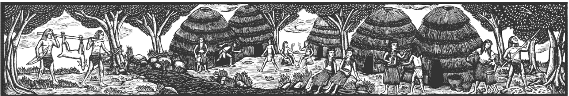
Top to bottom: 1. Neighborhood Tryptich; 2. Panoramic View (with the Baldwin Hills, Ballona Creek in the middle and historic Culver City buildings) 3. Portola Expedition; 4. Tongva Village.

La Cienega/Jefferson Station, Engraved in Memory, Daniel Gonzalez, Artist.