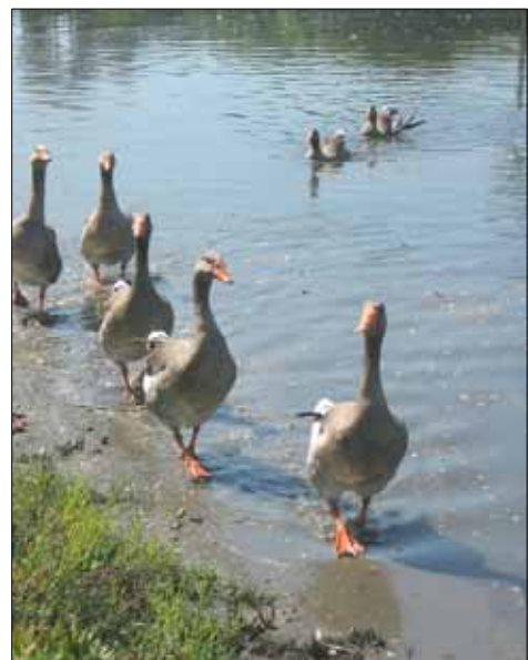
Geese approach people for food.

The project is expected to last 2 to 2 ½ years and cost about $2 million.